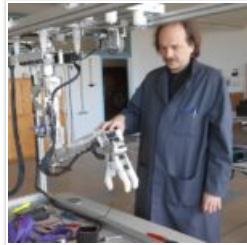
CTD goes behind the scenes at New Leipzig’s MRISAR Institute, whose robotic creations have been featured in museums and movies worldwide.