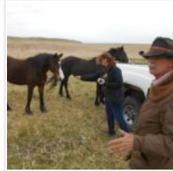
At Linton’s Nokota Horse Conservancy, CTD travelers will get up close to the magnificent descendants of wild horses of the Northern Plains.