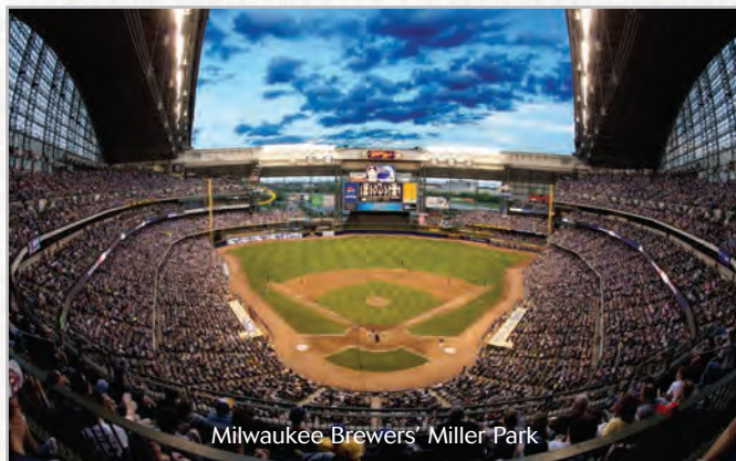
Milwaukee Brewers' Miller Park

Includes four nights at the 4-Diamond Hilton Milwaukee Downtown, directly attached to the Bead&Button show convention center!